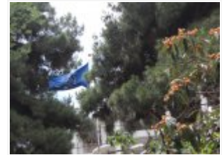
The European Return Fund