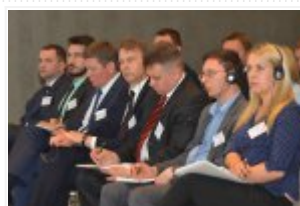
Representatives of the Ukrainian State Migration Agency