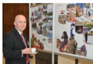
Photo Exhibition "Multicultural View of the World"