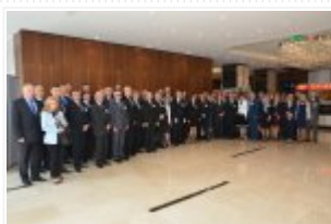
Participants during the conference