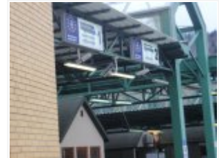
The External Borders Fund

2007 - EUR 7,169,354.28 2008 - EUR 7,860,469.93 2009 - EUR 8,688,538.00 2010 - EUR 8,195,390.00 2011 - EUR 9,508,340.00 2012 - EUR 13,132,873.00 2013 - EUR 17 232 700,00